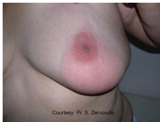
Figure 1. Breast Erythema in Inflammatory Breast Cancer

because of inflammatory cells' infiltration [4] [5]. However, alternative names including carcinomatous mastitis , mastitis carcinoma , acute mammary carcinoma , acute brawny cancer , lactation cancer , lymphocytoma of the breast , and breast cancer of pregnant and lactating women have not been widely cited [6]. On the other hand, according to the American Joint Committee on Cancer, IBC is a clinicopathological entity characterized by diffuse erythema and edema of the breast, often without an underlying palpable mass [7].