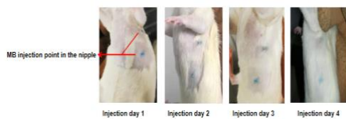
Figure 2 Papillary blood flow and skin condition after MB injection by INN in rats

After the injection of MB by INN method, the rats were observed for 4 consecutive days to observe the blood flow of the papillae and whether necrosis occurred, and the overall process of papillae did not show blood flow obstruction and necrosis, and the rats were in good condition (Figure 2).